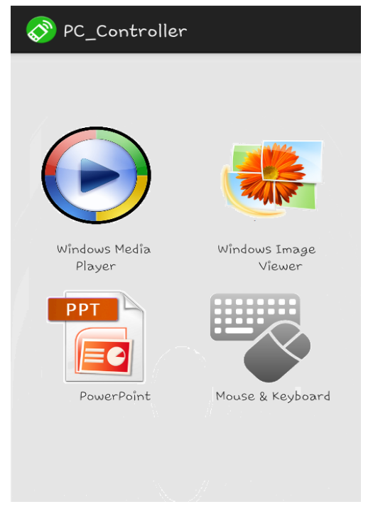
Fig. 4 Options Module

Fig. 3 shows the login module of the system. After valid user authentication, the user will see the different options as shown in Fig. 4.